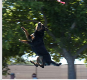
Camera not keeping up!