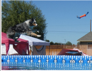
Look at me track that toy!