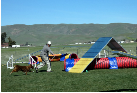
Scout Lovelis and Slyder and the beautiful Livermore view.