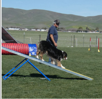
One more step and I am in the Yellow