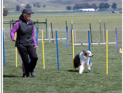
Look at me do those weaves