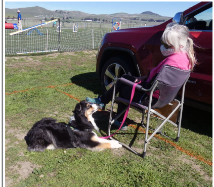
What a pretty down!