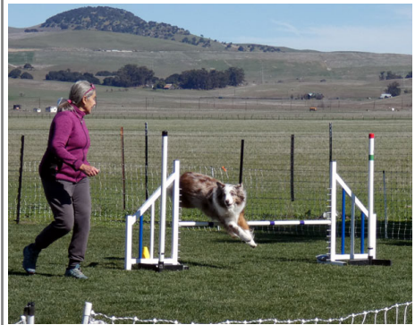
Didn't I do a nice run?