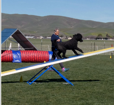
Can't wait to get off and make Mom run!